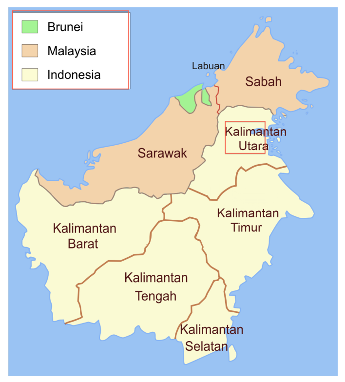
Figure 2. Map of Borneo

which they have close historical relations. While they speak the language of the group with which they have settled, the members of these sedentary groups do not typically speak Punan Tuvu'. With the spread of Indonesian as a national language, Kenyah and Punan speakers also communicate with neighboring populations in Indonesian. In certain official contexts Indonesian is also used between Punan speakers. Punan Tuvu' is classified as a separate branch belonging to the North-Sarawak subgroup. Figure 2 shows the approximate location where the languages discussed in this paper are spoken.